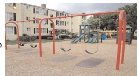
Typical wear mats installed in kick-out areas.

6. In kick-out areas, such as swings and slides, install wear mats on top of the EWF to prevent holes and to maintain a level surface. Be sure these mats are installed in such a way as they do not have an edge above the surface that will create an accessibility issue. Tapered edges are recommended.